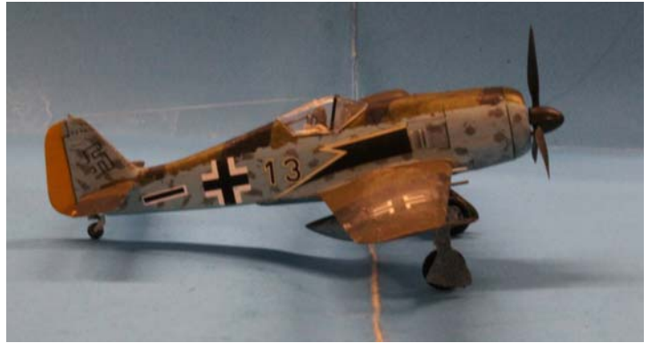
Chuck Converse's 1/72 nd Hasegawa FW-190A in the markings of "Pips" Priller on D-Day.