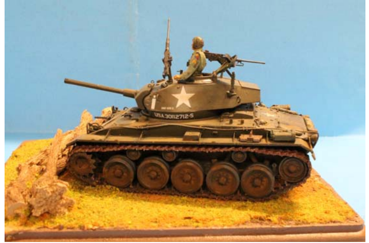
Keith Touchette's 1/35 th AFV Club M24 Chaffee with Fruil tracks and Blast Models storage